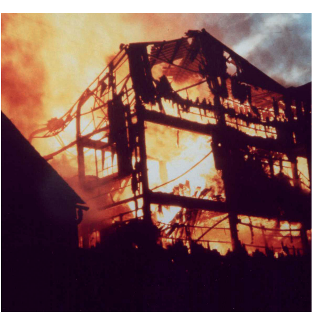
Great Western Mill fire, 22 June 1960.