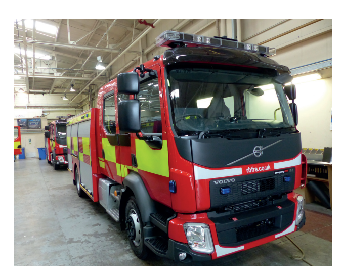
The Volvo fire appliance, which arrived in 2017.

These appliances are being firstly placed in stations which spend a lot of the time working across the Oxfordshire and Buckinghamshire borders. In future, when any old appliances are retired from service, they will be replaced by the new Volvo fire engines.