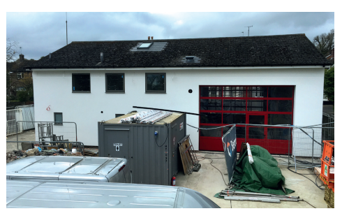
The exterior walls are remodelled.