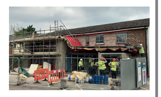
The arch is installed at the front of the station.