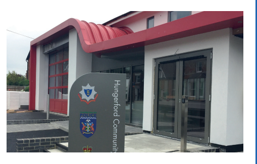
Finishing touches being applied at the station ready for the opening ceremony on 3 July.