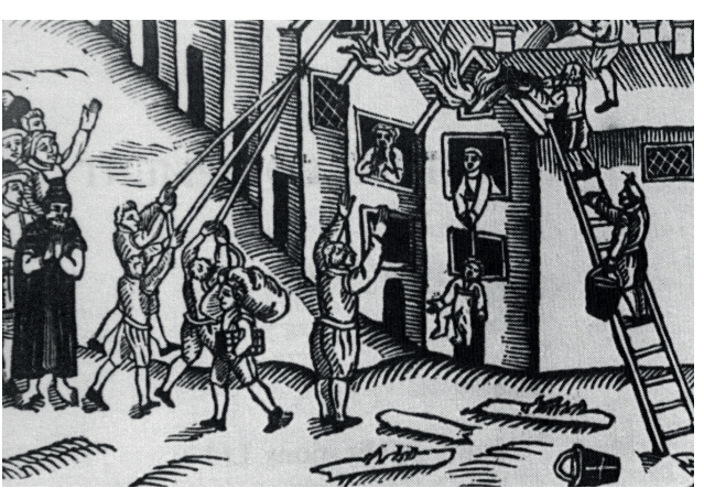
Drawing of 1598 showing fire-hooks, ladders and buckets in use.

A large number of properties in the area were completely destroyed by the fire, and there is likely to have been damage to other nearby buildings. Rebuilding would take a variable amount of time — with Queen's Mill rebuilt at least by 1574, but other properties took longer. For example, 1 High Street was still described as "decayed by fire" in 1591, and was finally rebuilt by around 1609.